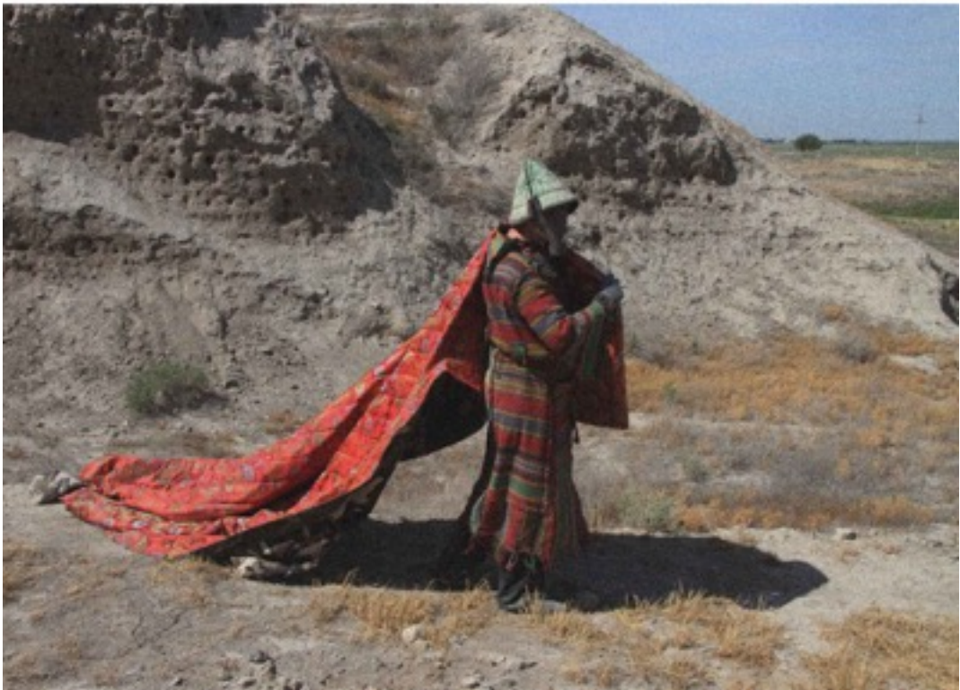
“A Pilgrim”. Video 04.50 seconds. 2014