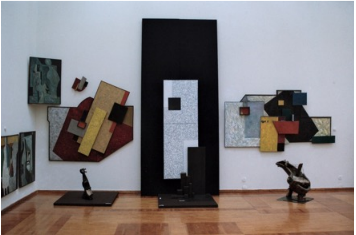
"Neoconstructivism-01". Oil, wood, metal on canvas. 1995