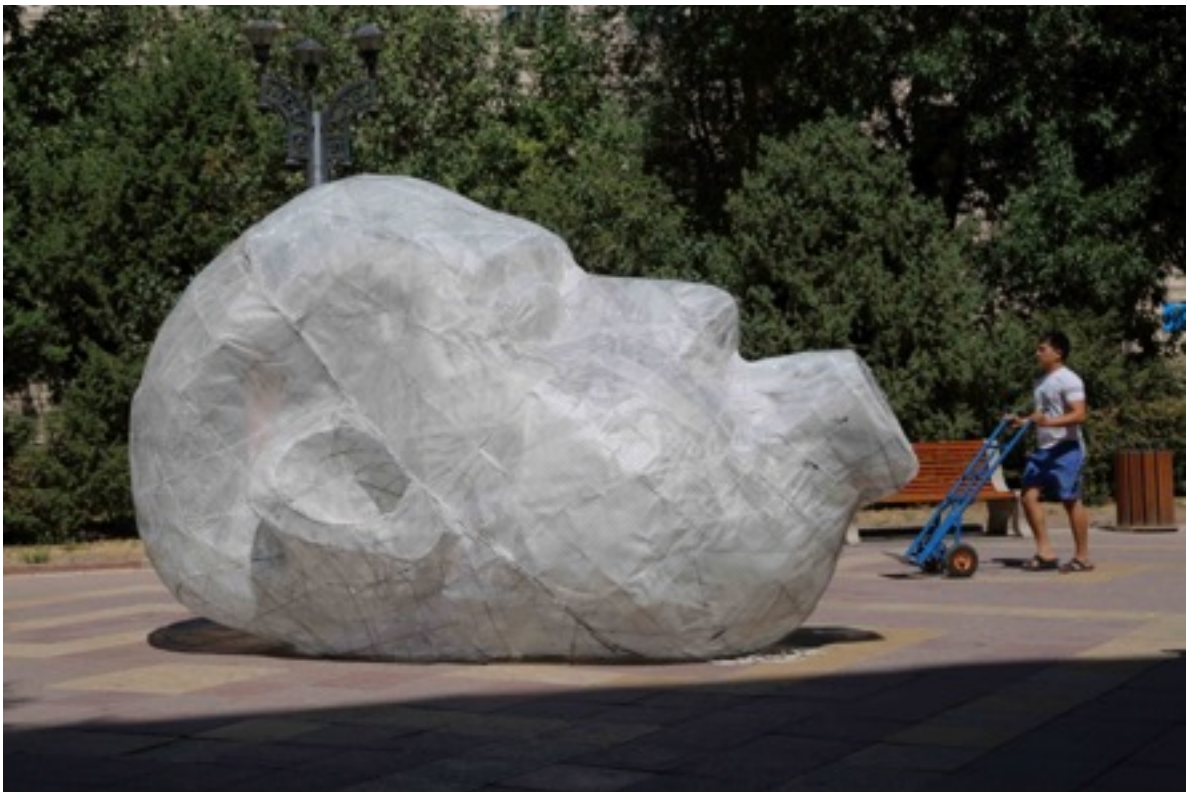
“Clouds” Metal, synthetic net. Hight 220 cm. 2015