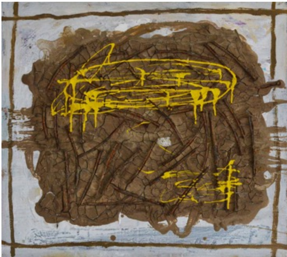
"Shaman's Interior Design". Clay, nails, acrylic on canvas. 60x60 cm. 2013