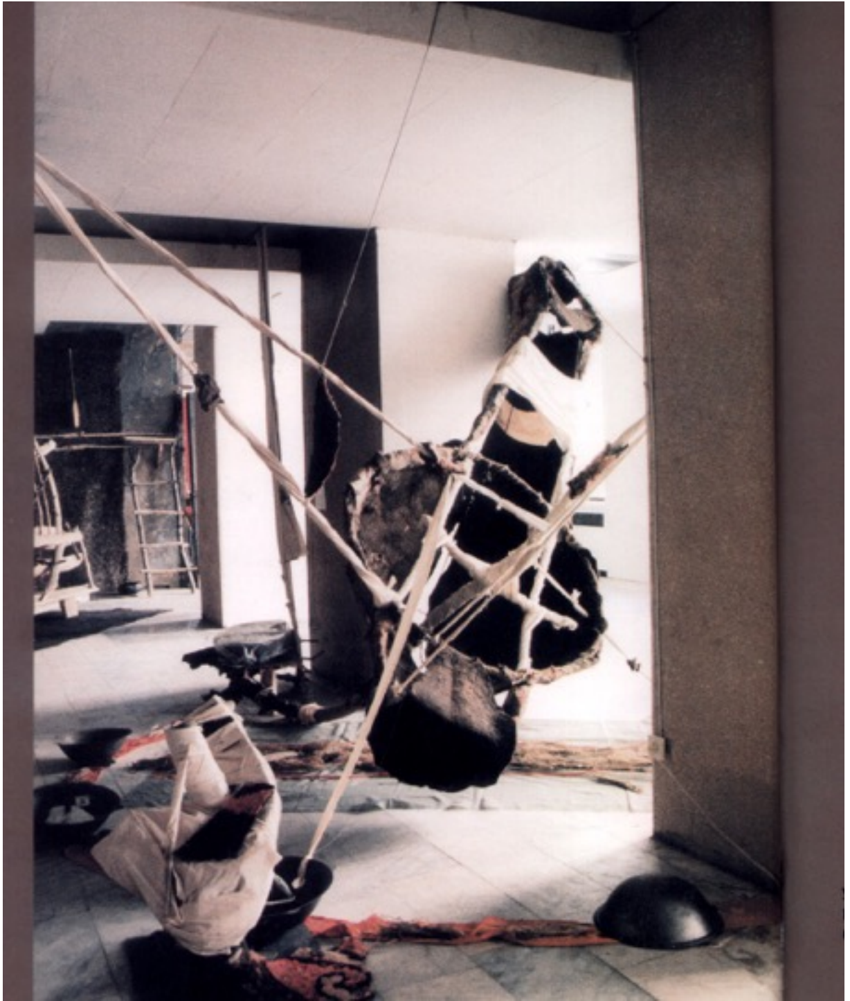
"Time chain". Felt, metal, fabric. 4x3m. 1998