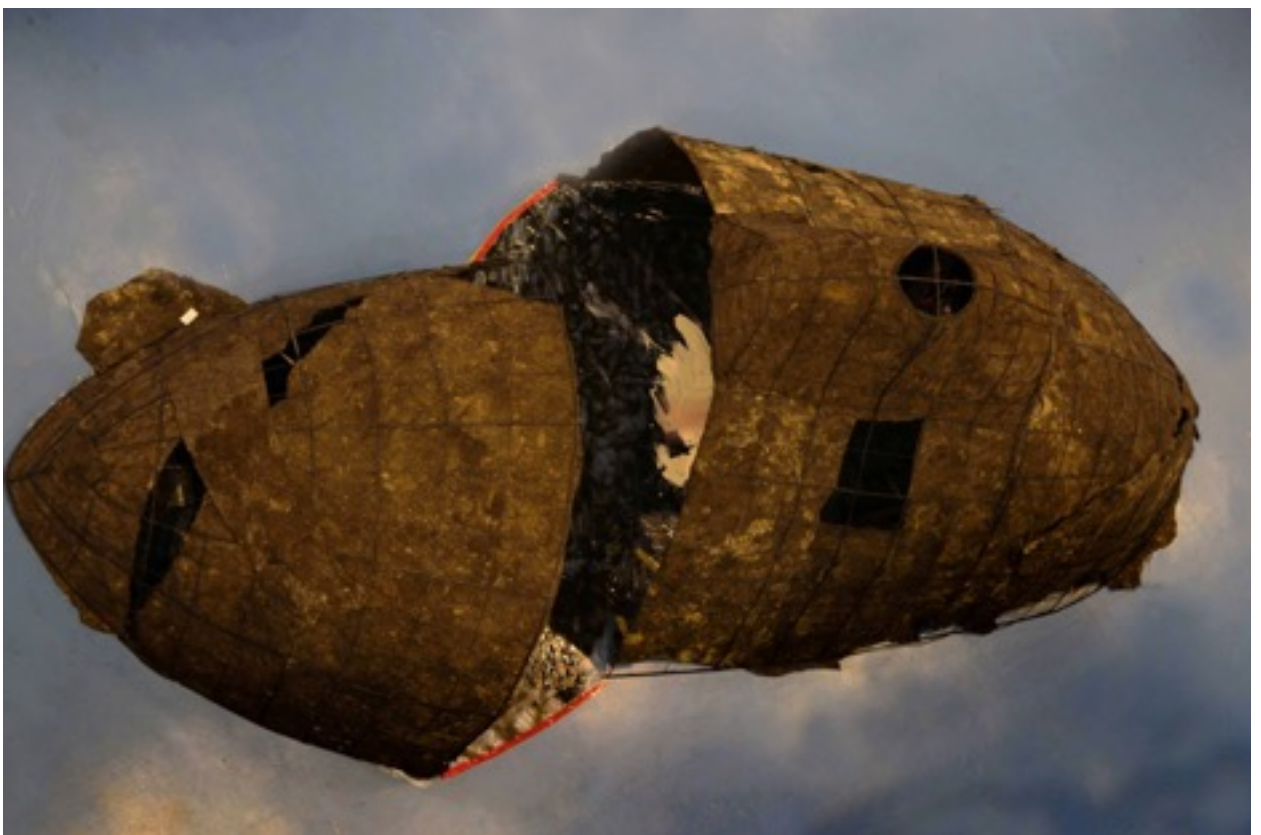
"Semipalatinsk Nuclear Test Site". Felt, metal. Length 700 cm. 2012