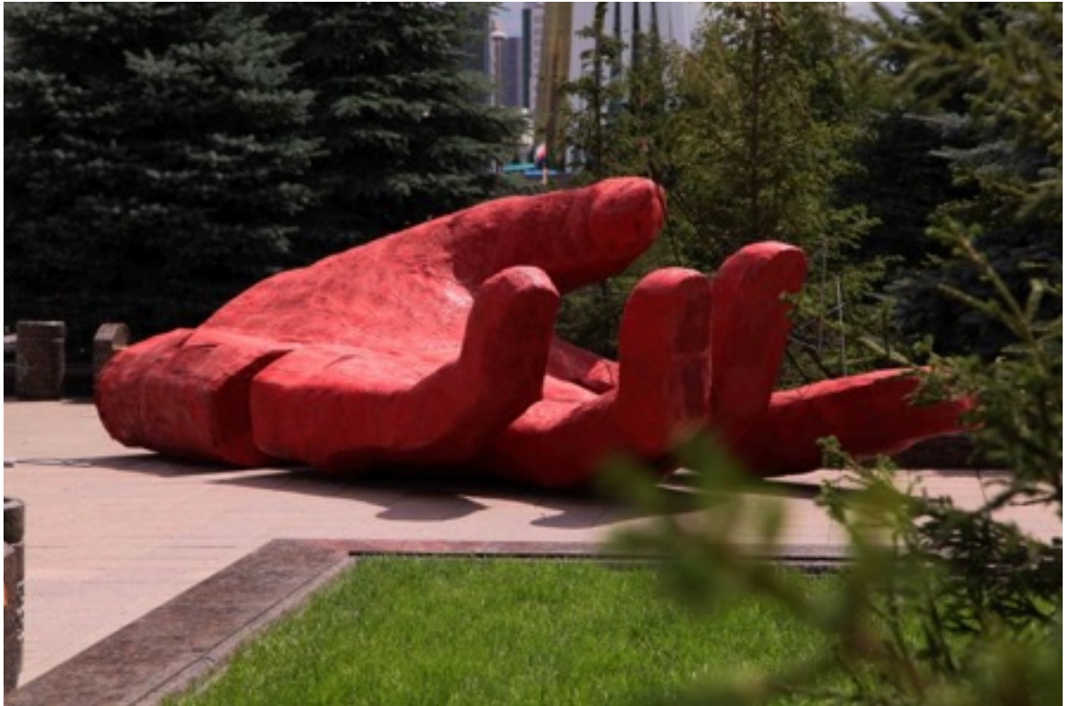
“Contact”. Metal, fabric. Length 600cm. 2015