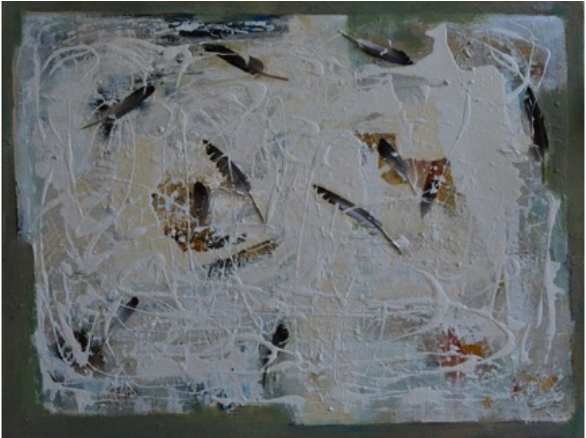
"Turkestan". Oil and feathers on Canvas. 70x100 cm. 2012