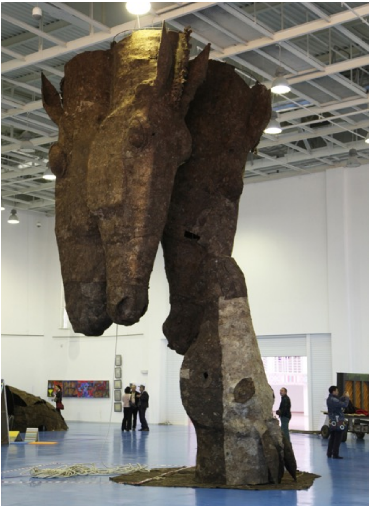
“A Horse Herd”. Felt, Metal. 2012