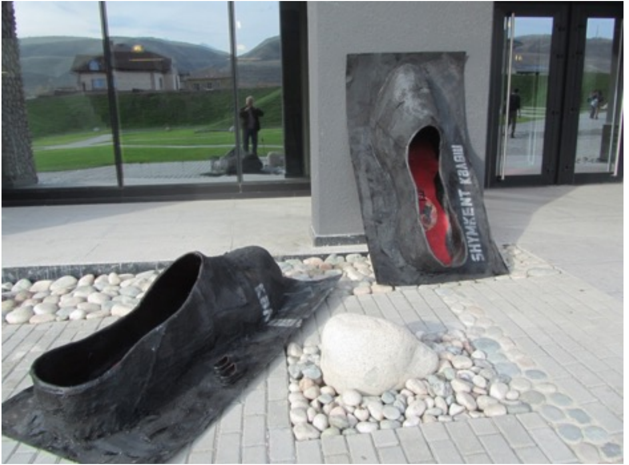
“The Door Way”(Galoshes) Metal, металл, fabric, wax. length 200cm. 2015.