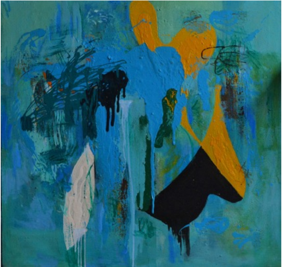
“A Heaven Shepherd” Oil on canvas. 100x100 cm. 2013