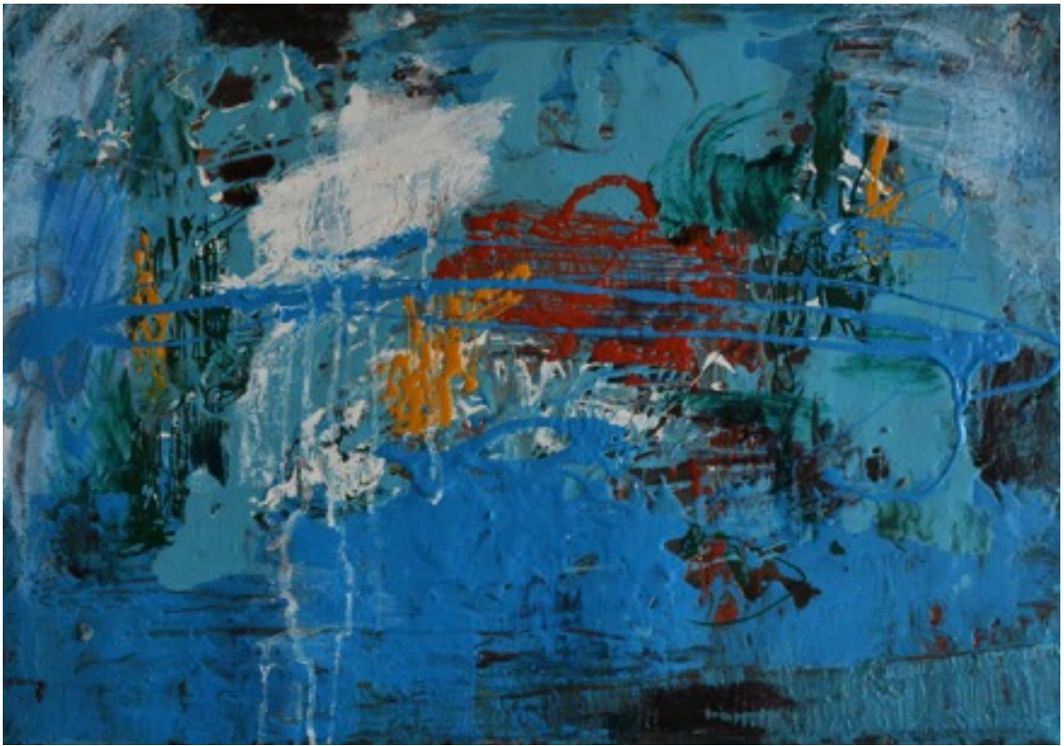
"Blue Steppe" Acrylic on Canvas 70x100 cm. 2013