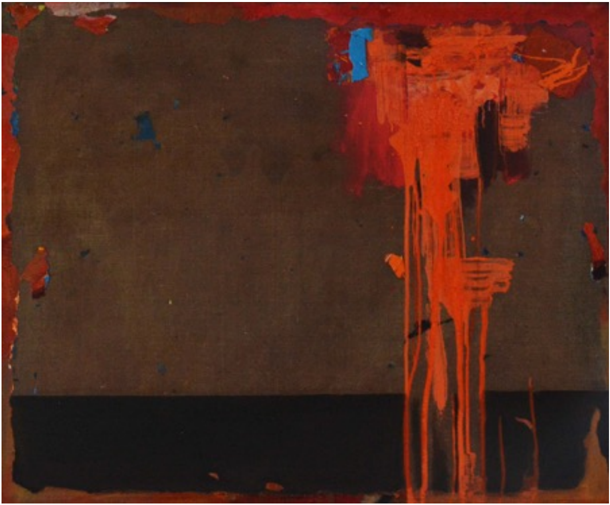
“Betpakdala”. Oil on canvas. 70x90cm. 2014