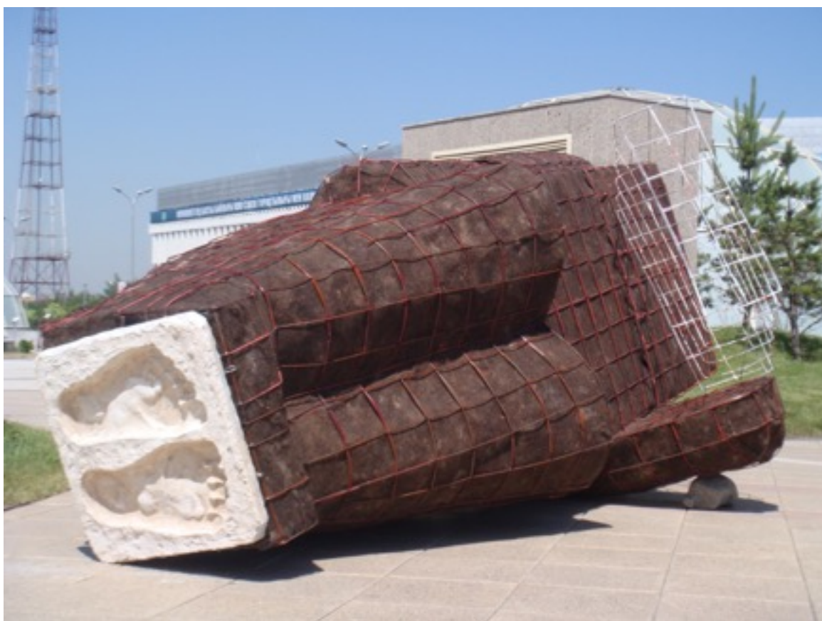
“A Nomad”. Felt, Metal, Gypsum. Length 500 cm. 2011