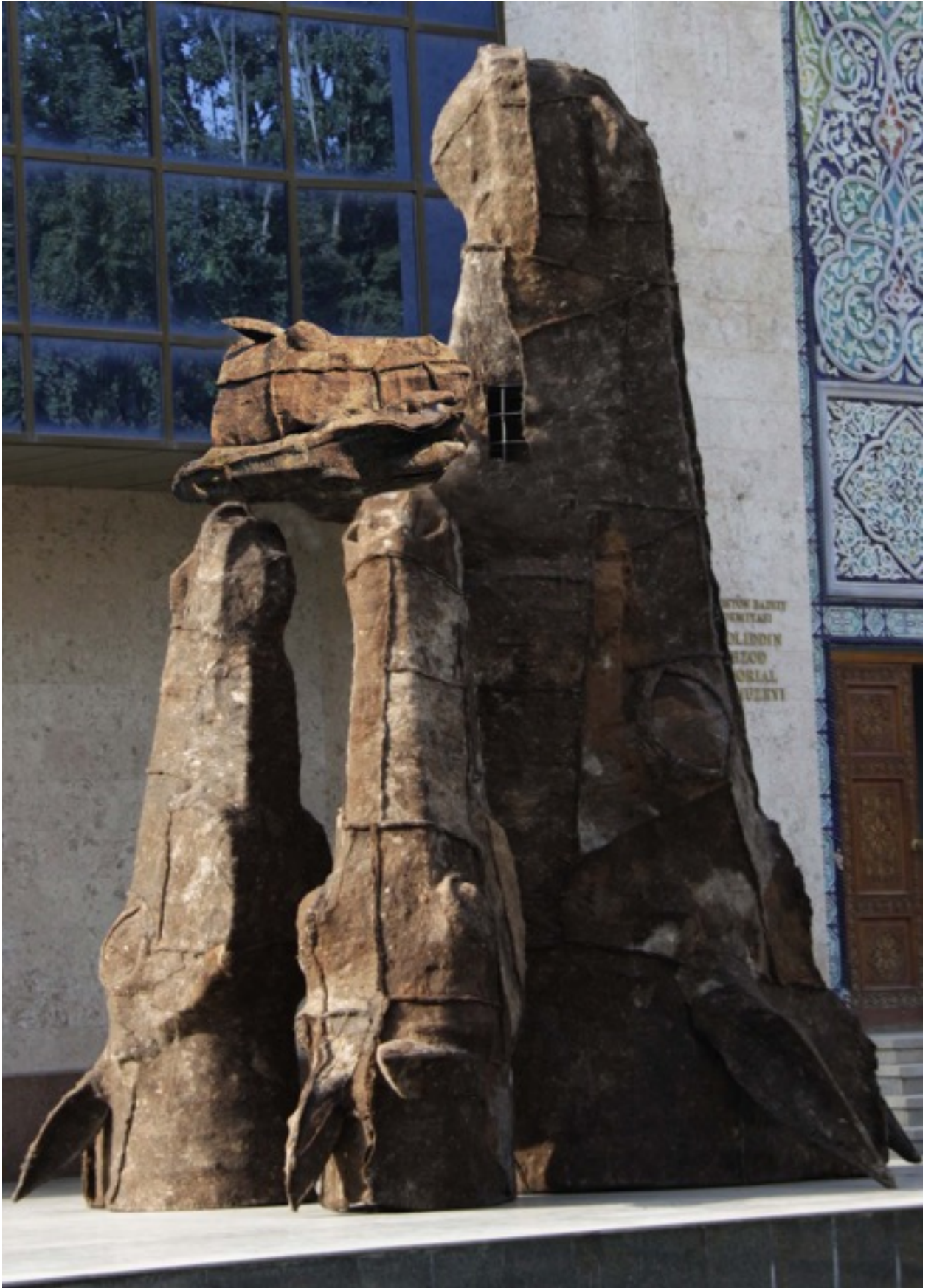
"Horse Herd 02". Felt, metal. 600 cm. 2013