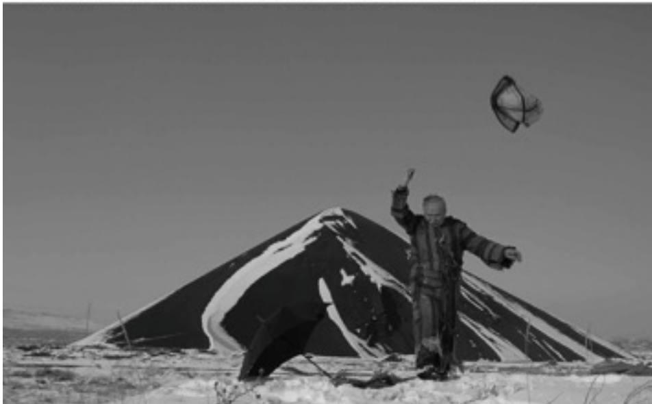
Performance at Shymkent Lead Refinery Waste Site. Photo 70x105cm. 2014