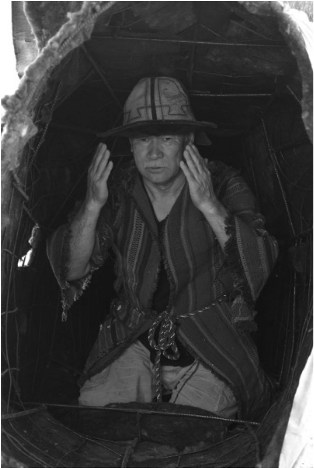
“Ayt” Performance. 2012