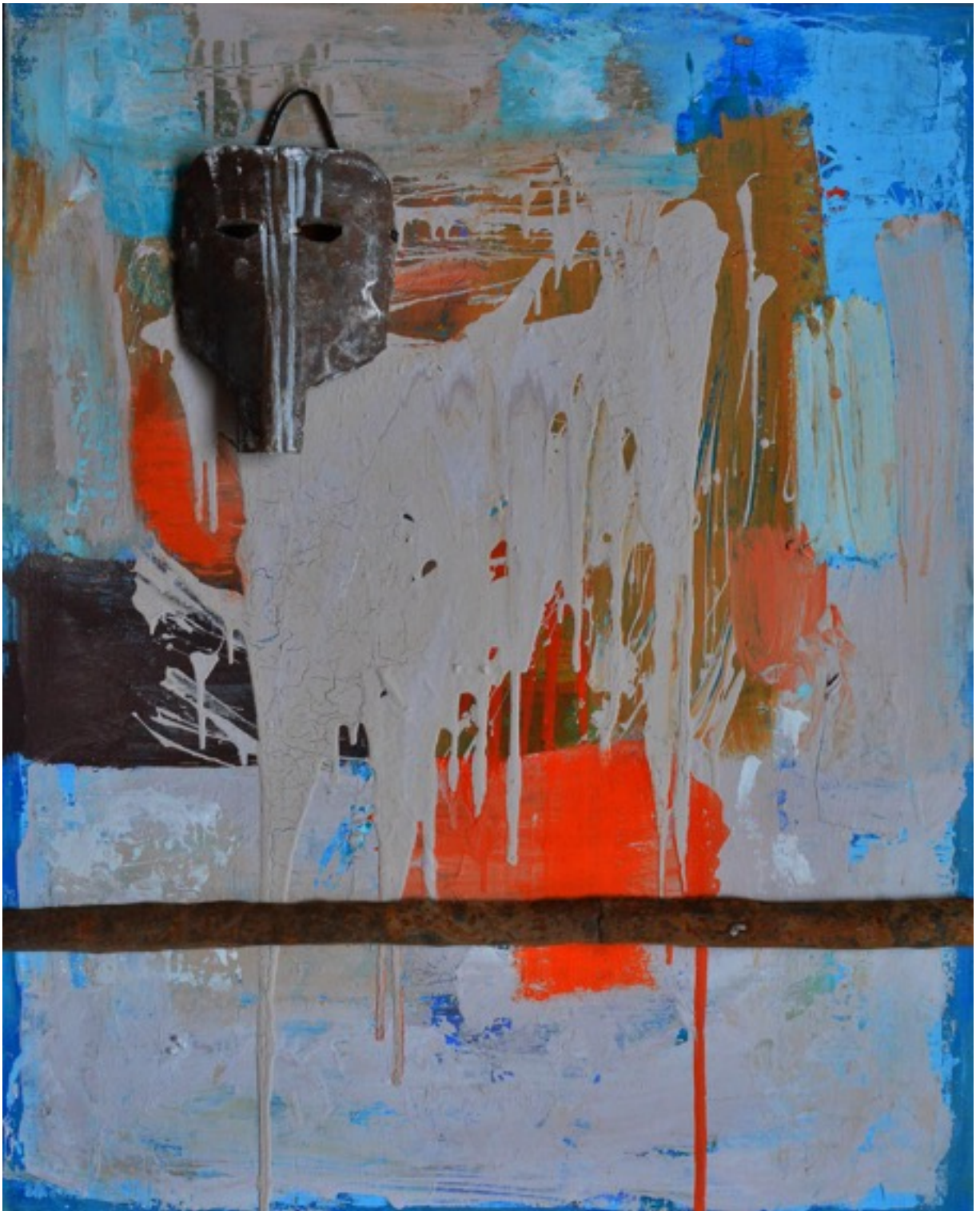
"A Shaman's Masque". Acrylic, wood, metal on canvas. 80x110 cm 2014