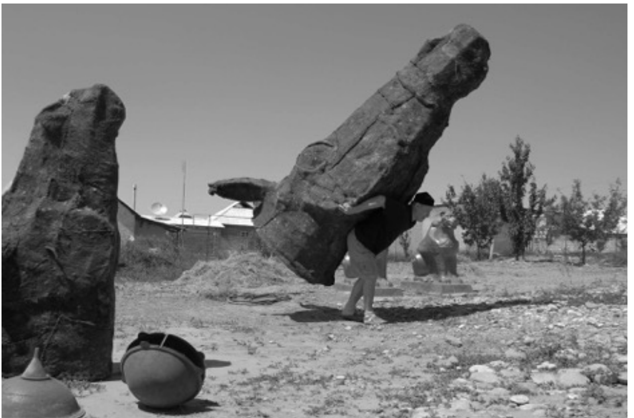
“A Shepherd 02”. Performance 2012