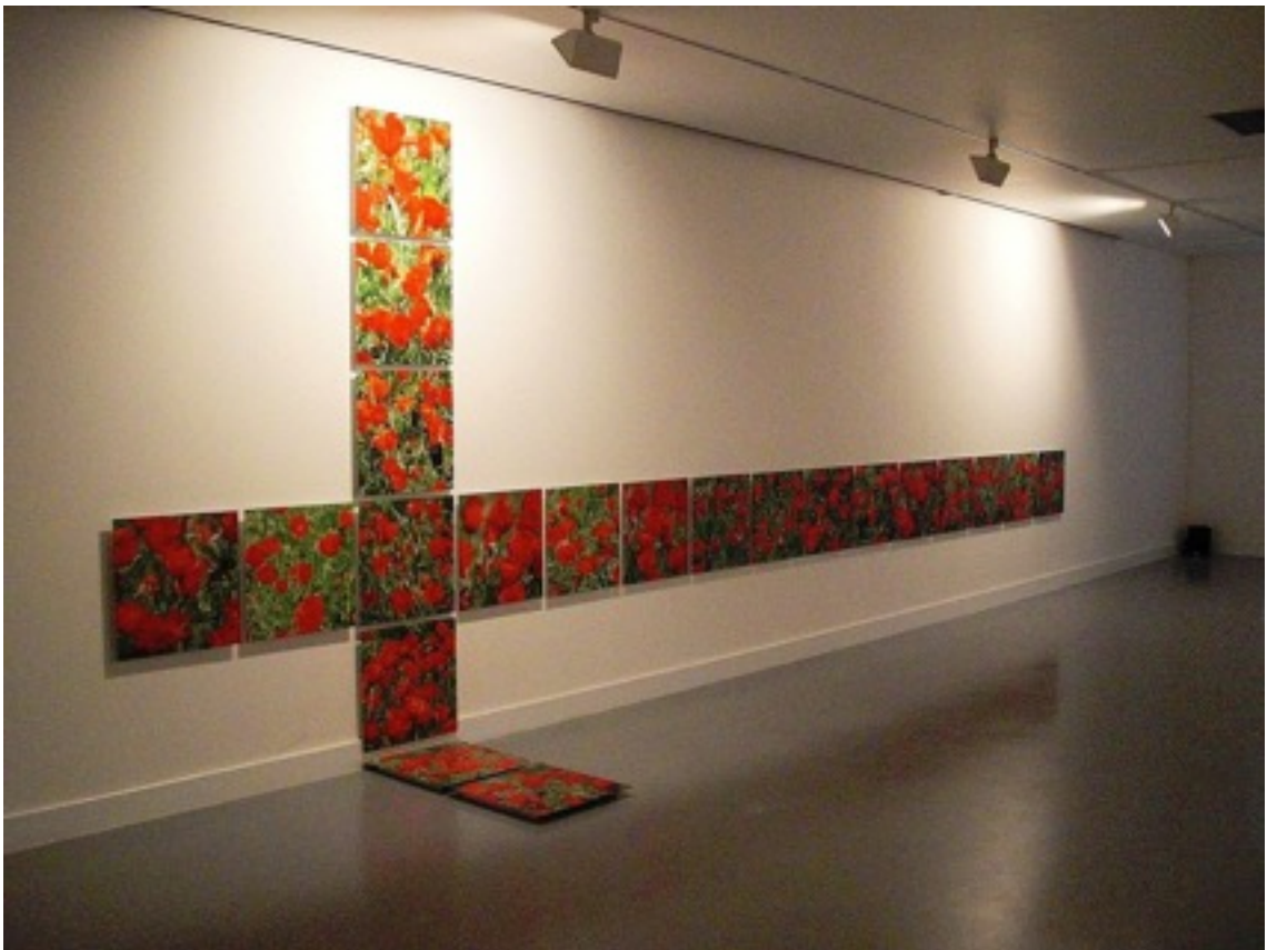
CONSTELLATION OF THE SOUTHERN CROSS (photo installation , photo steppe poppies ,each photos 50x50cm)-2010