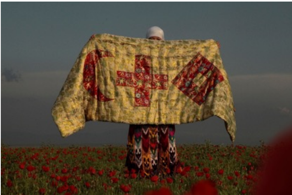
MY RED CROSS (from the series FLAGS)-100x150cm-2013-photo.5+1AP