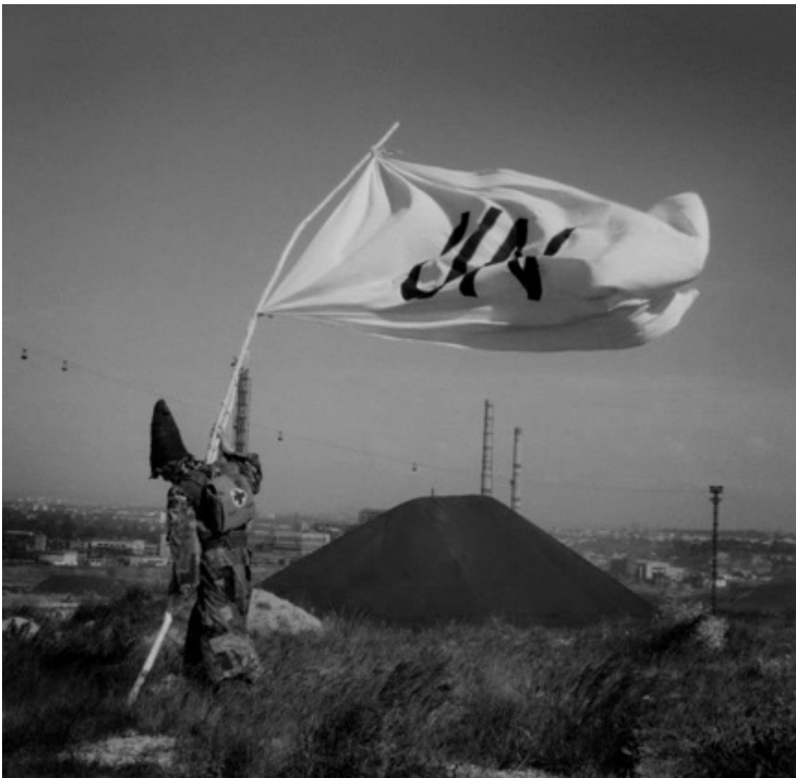
“JOURNEY TO THE EAST-02”(SHYMKENT,SOUTHERN KAZAKHSTAN) performance 50x50cm.photo.