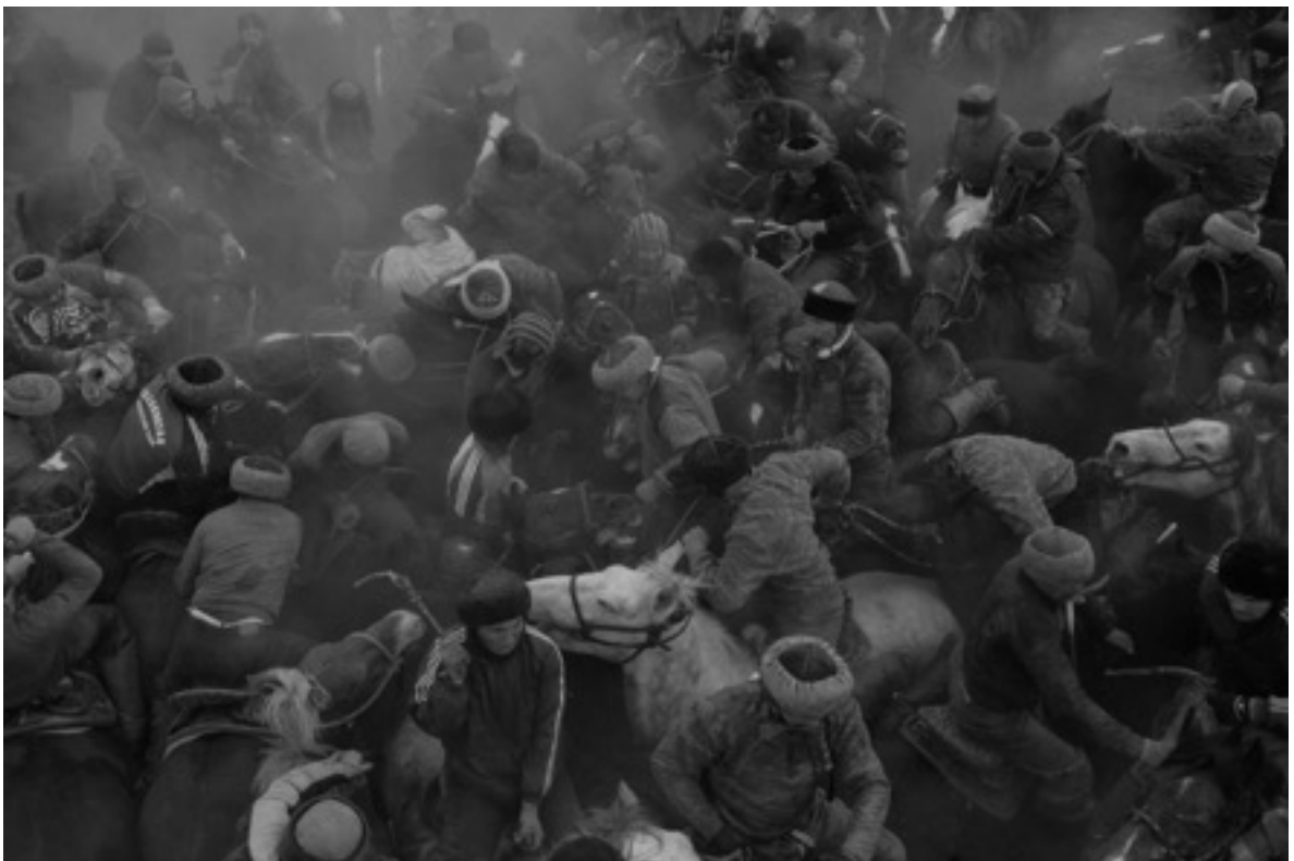
STEPPE WOLVES-07.photo 120x18cm .2012.5+1AP