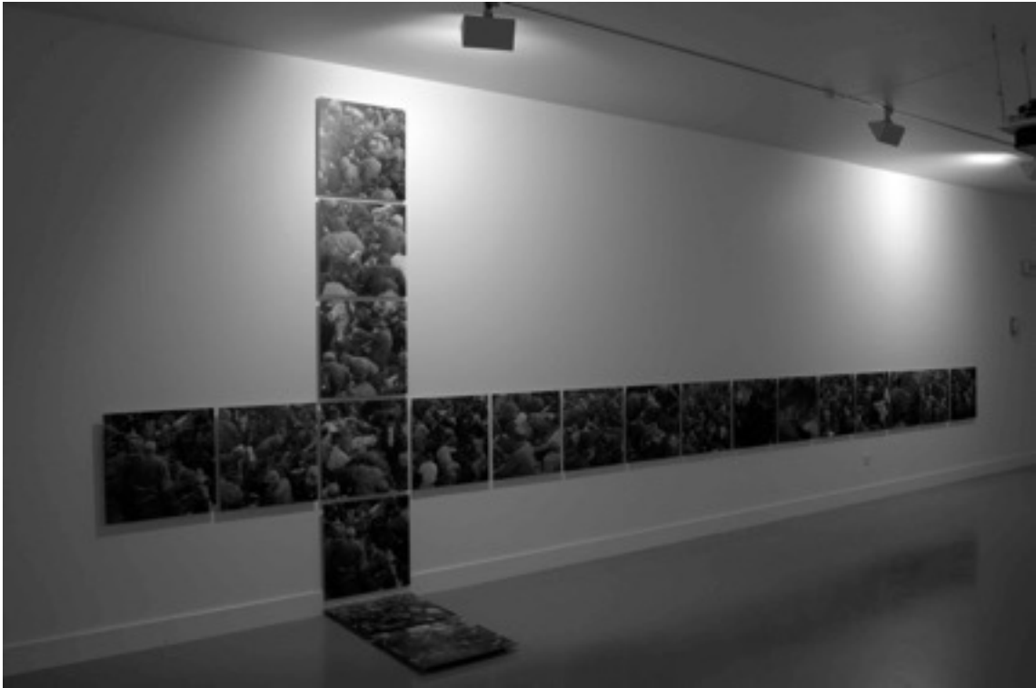
CONSTELLATION OF GENGHIS KHAN (photo installation , photo of traditional games kokpar, each photos 50x50cm)-2010