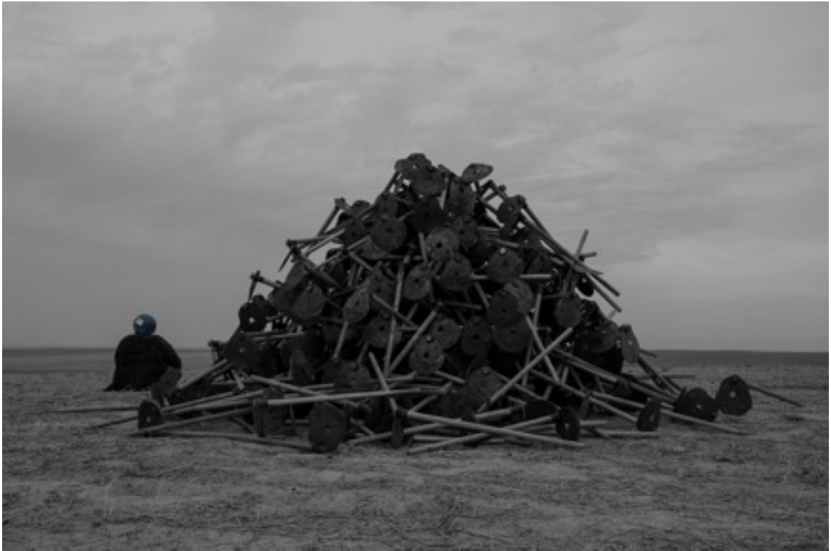
“CUSTOM STATION” photo 70x105cm. 2015.5+1AP