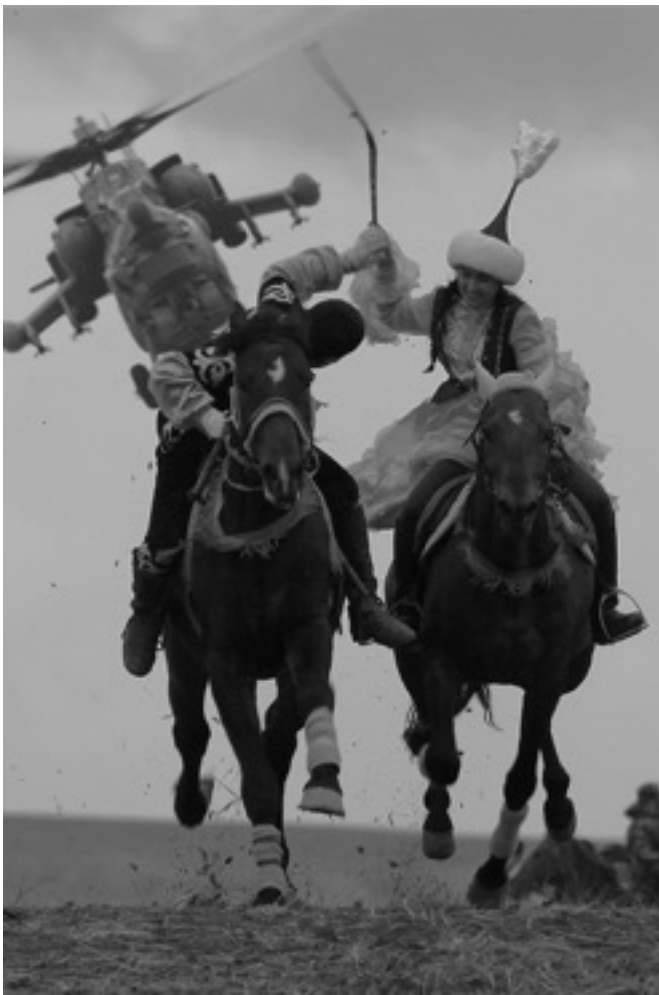
“KIZ KUU”180x120cm.photo collage.2013.5+1AP