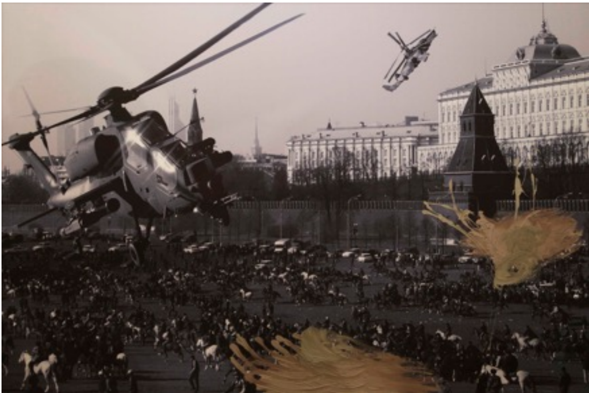
“MOSCOWKOKPAR”-(photo- clay.. photo collage )120x180cm-2014.5+1AP