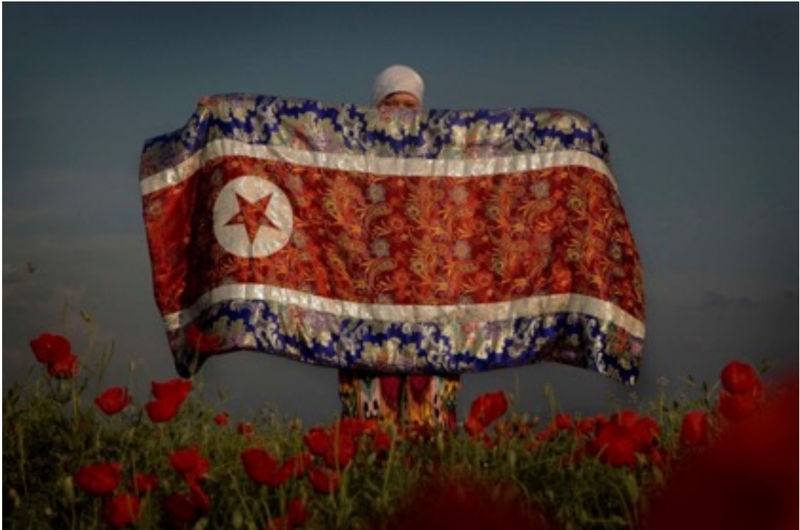
MY NORTH KOREA(from the series FLAGS)-100x150cm-2013-photo.5+1AP