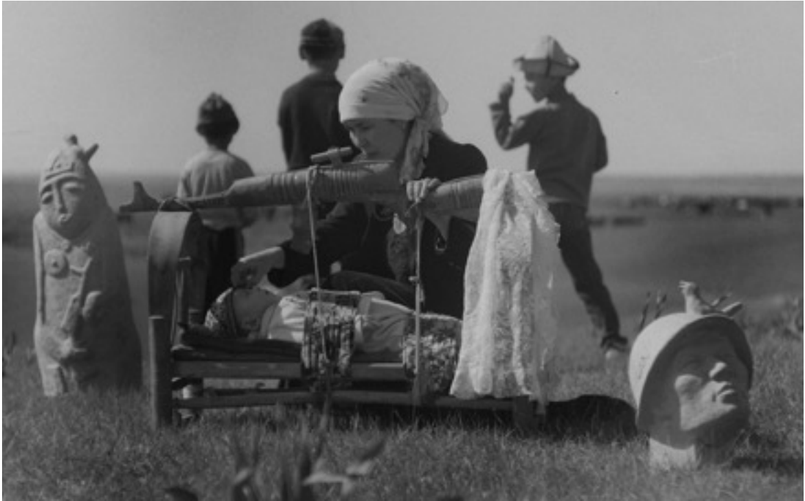
“SNIPER” video(27.06) .2005.5+1AP