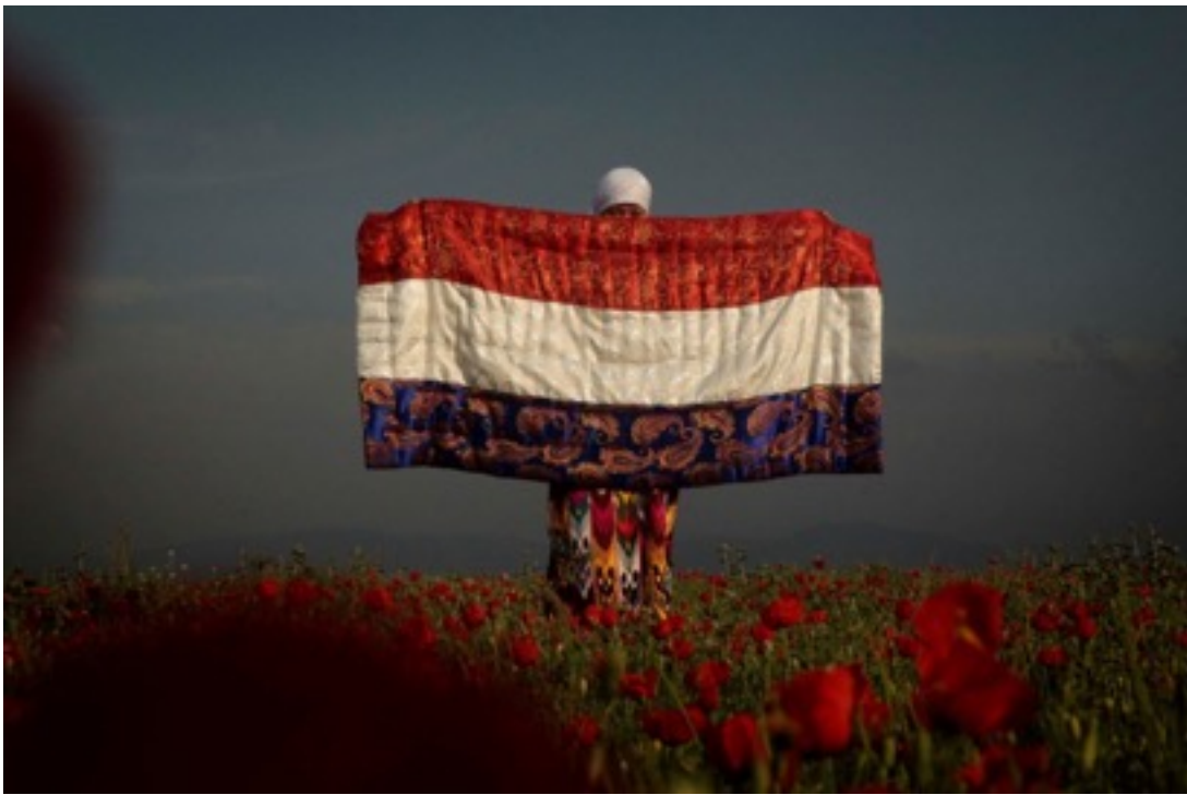
MY NETHERLANDS (from the series FLAGS)-100x150cm-photo.5+1AP