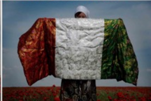
“KORPESHE-FLAGS” series photo.67x100cm.2011.5+1AP