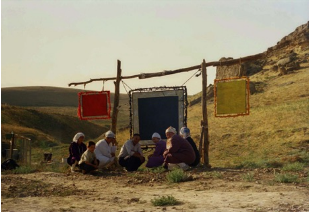
“JOURNEY TO THE EAST”, (KYRYK SHYLTER, SOUTHERN KAZAKHSTAN)-1995.photo.5+1AP