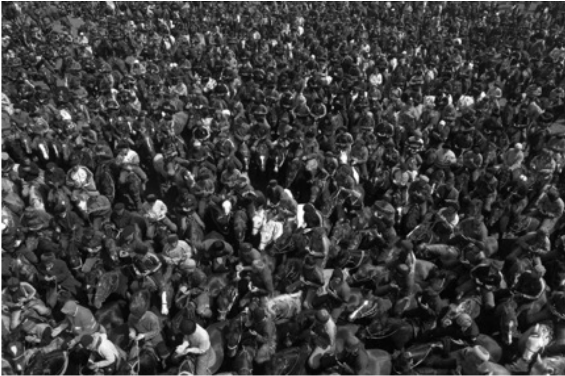
BATTLE FOR THE SQUARE-020.photo.120x180cm.2014. 5+1AP