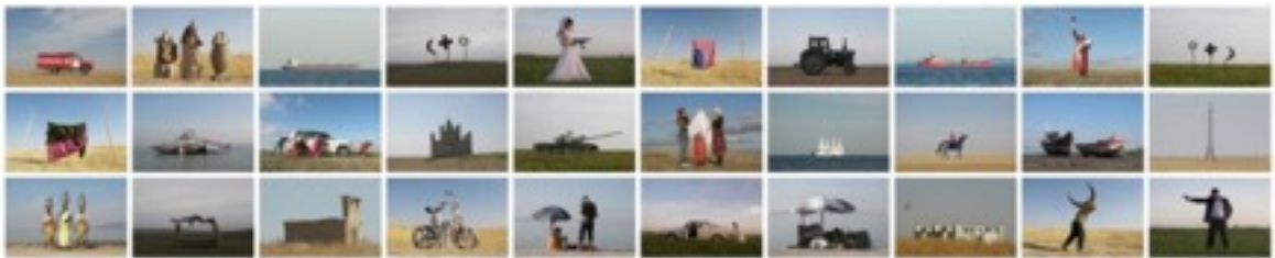
“WAY TO ROME” (series photo)50x65cm.2007-09.5+1AP