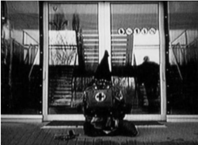
“NEON PARADISE” duration 10min.2004.5+1AP