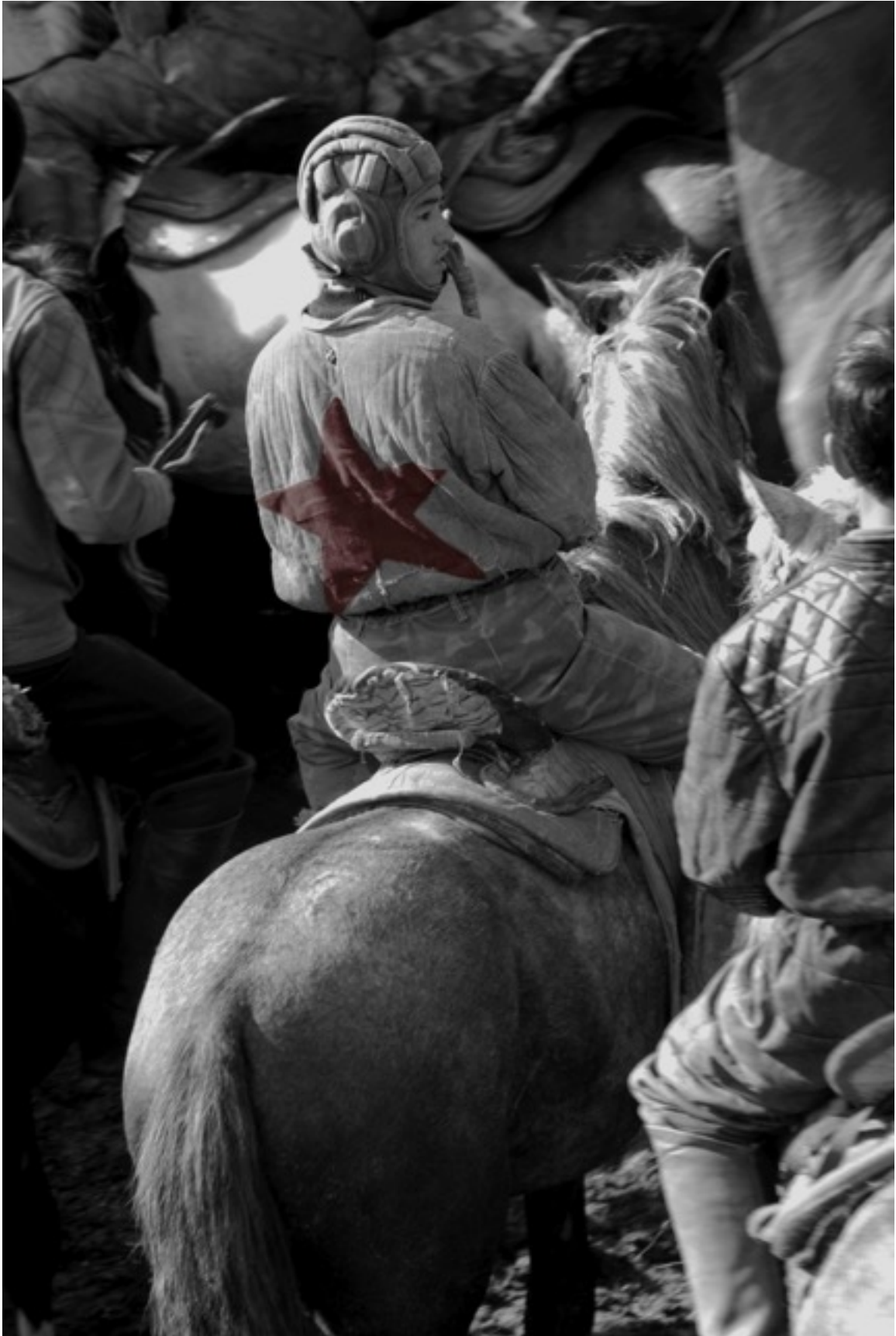
“STEPPE WOLVES” series photo.100x70cm.2009.5+1AP