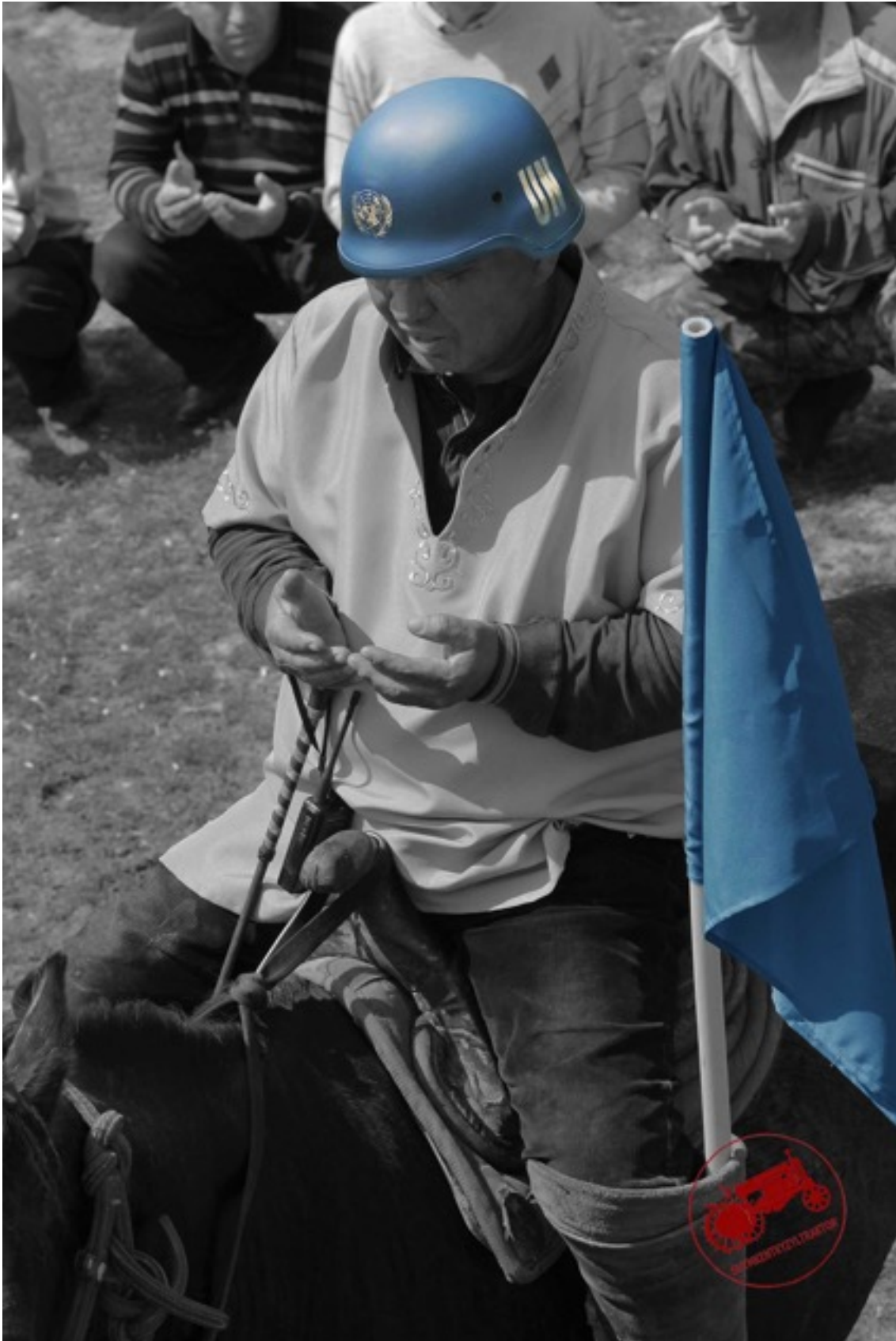
“UN POLICE” (photo collage).180x120cm.2013.5+1AP