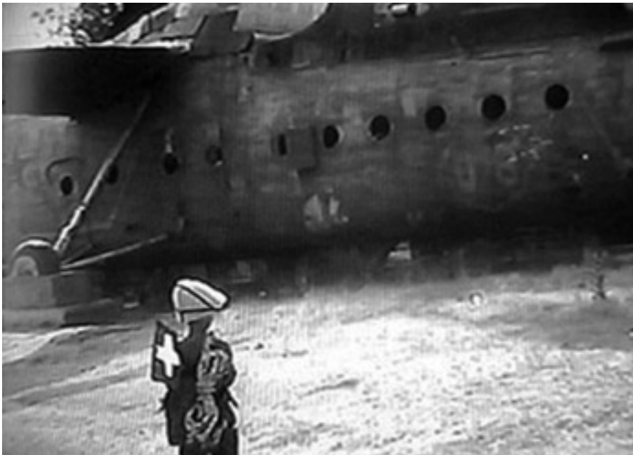
NOAH'S ARK"video (29.10) 2004.5+1AP