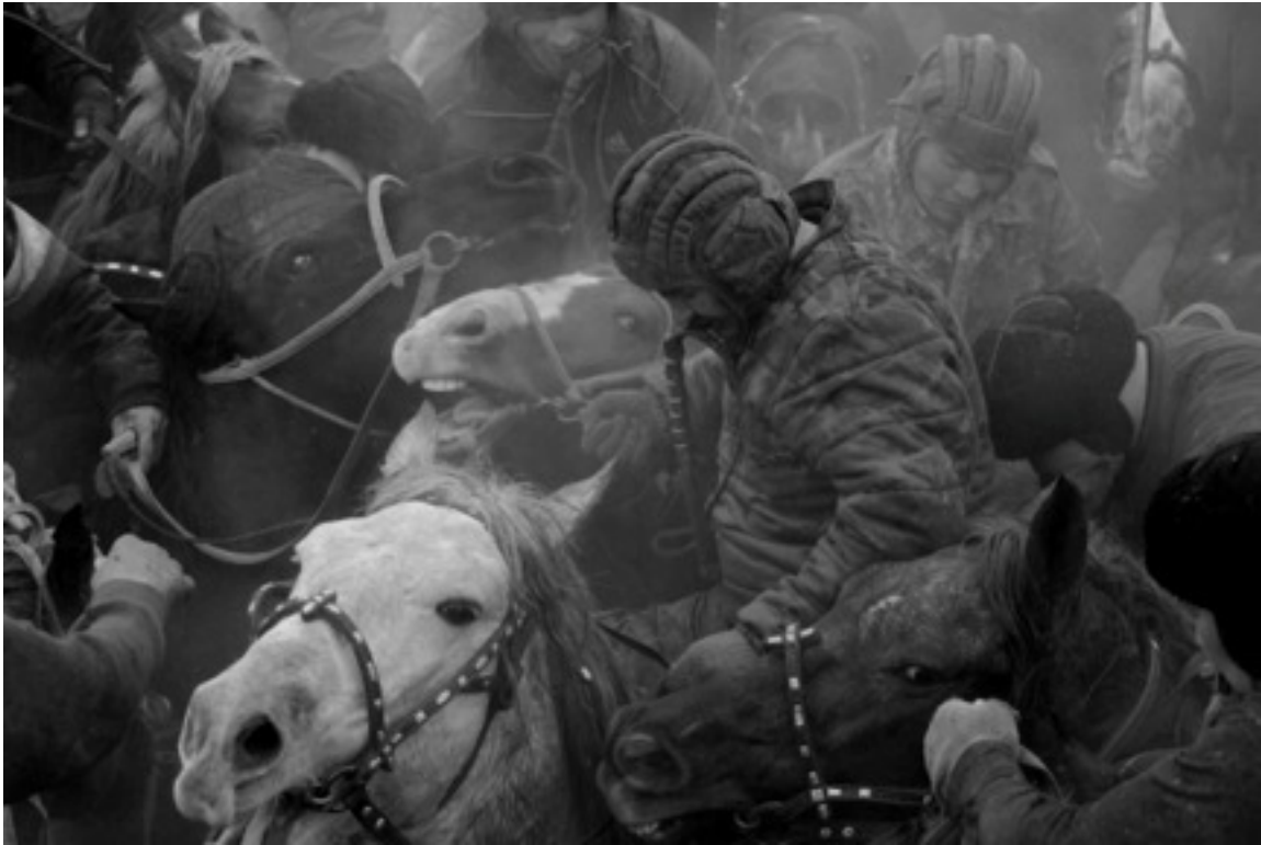
BATTLE FOR SQUARE 07. series photo 120x180cm.2011.5+1AP