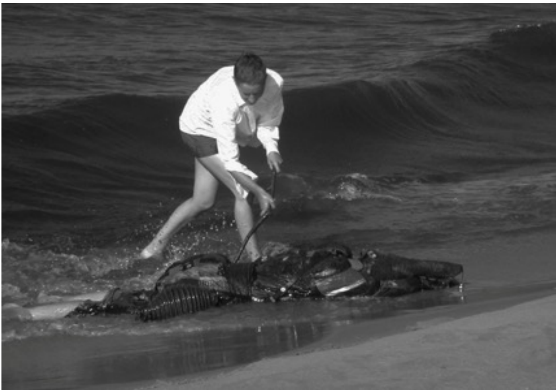
“MEMORY ERASING” (Baltic Sea) performance.35x50cm.2002.5+1AP