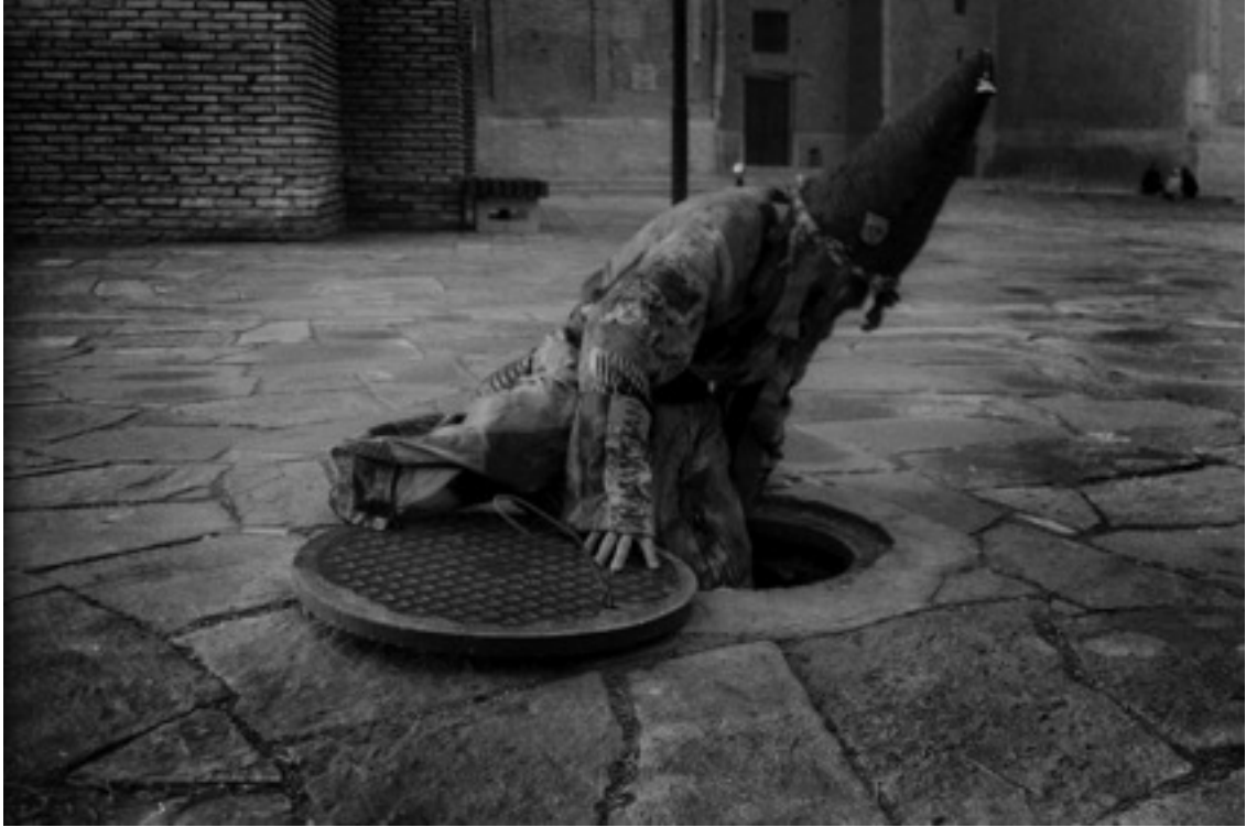
“UNDERGROUND PARADISE” performance. (H.A.Yassau complex, Turkestan) photo 50x70cm. 2002.5+1AP