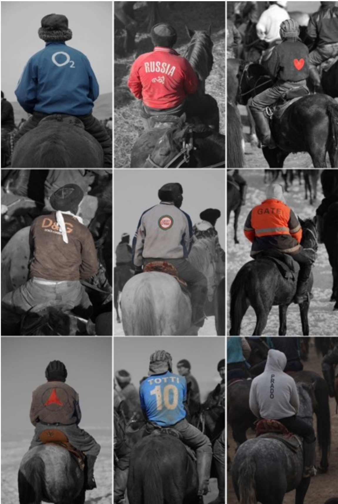
“STEPPE WOLVES” series photo.100x70cm.2009-16.5+1AP