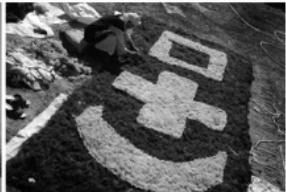
“FAREWELL OF SLAVIANKA” ,slideshow photographs.2011