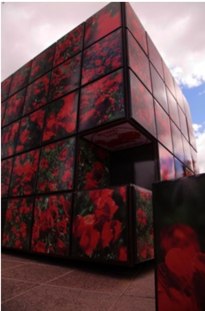
“RED CUBE “ (photo steppe poppies ,each photos 47x47cm) 245x245x245x245cm.2015