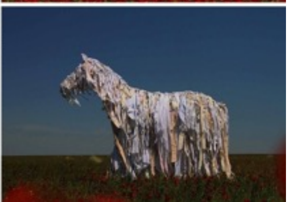
“WAY TO ROME” series photo.70x105cm.2011-15. 5+1AP