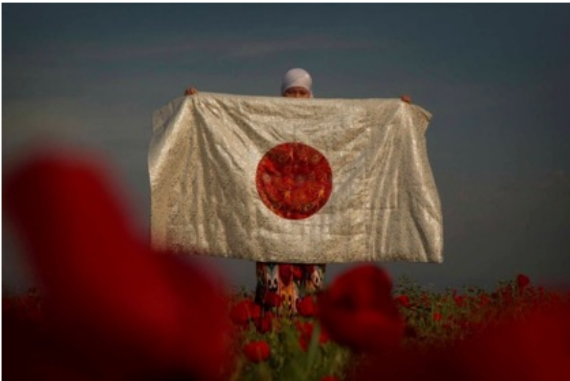
MY JAPAN (from the series FLAGS)-100x150cm-2013-photo.5+1A