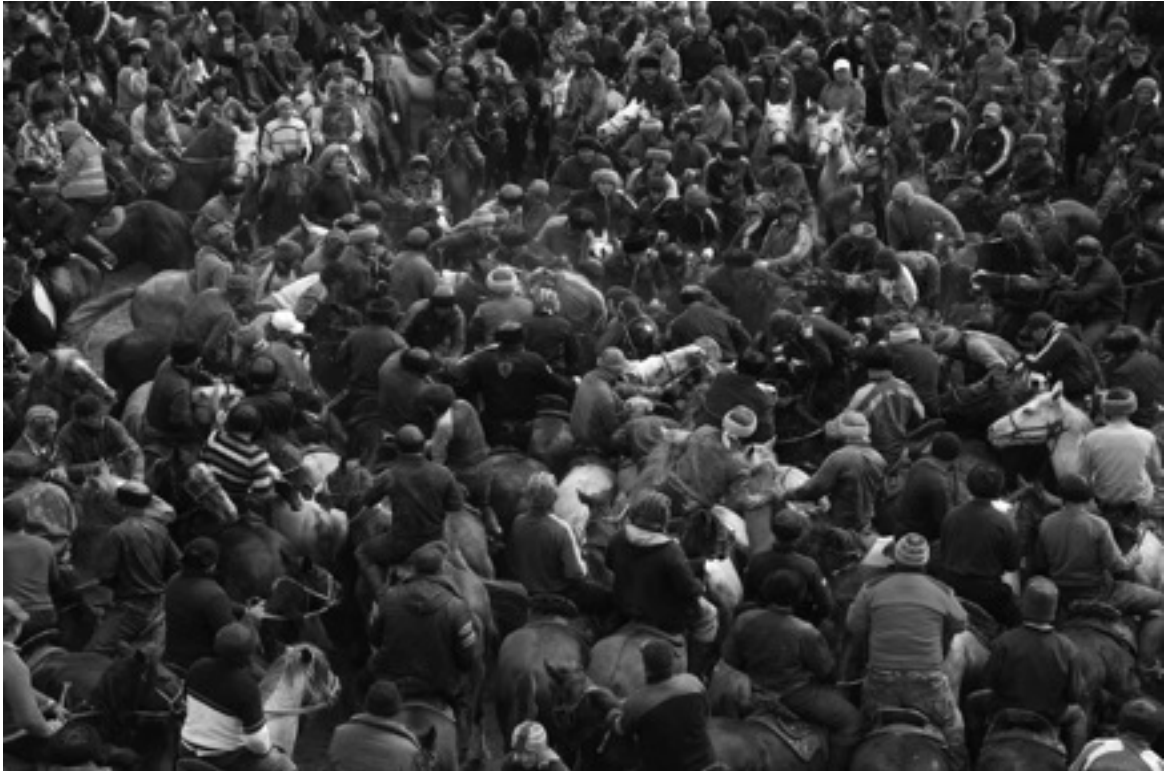
BATTLE FOR THE SQUARE-021.series photo.120x180cm.2014.5+1AP