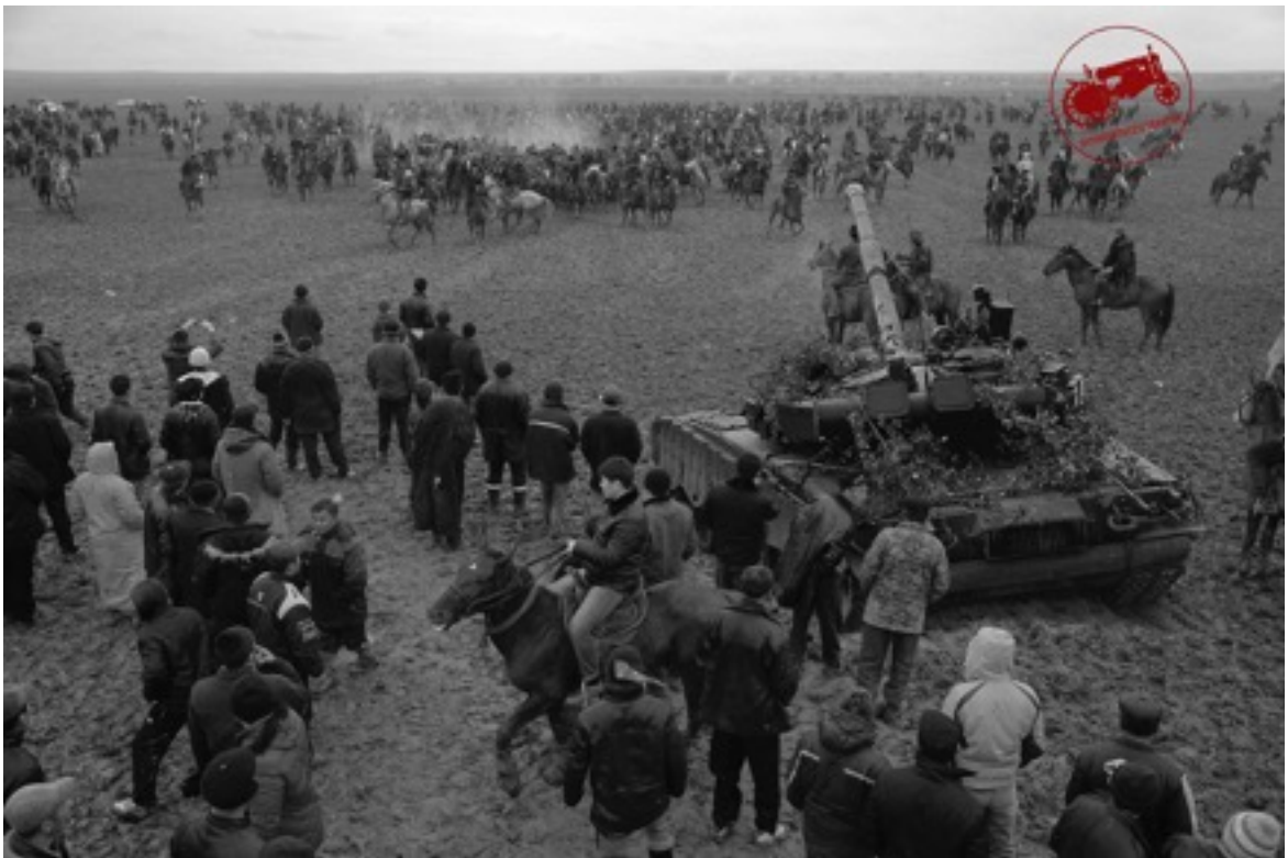
“DARBAZAKOKPAR-02”( photo collage )120x180cm-2014.5+1AP