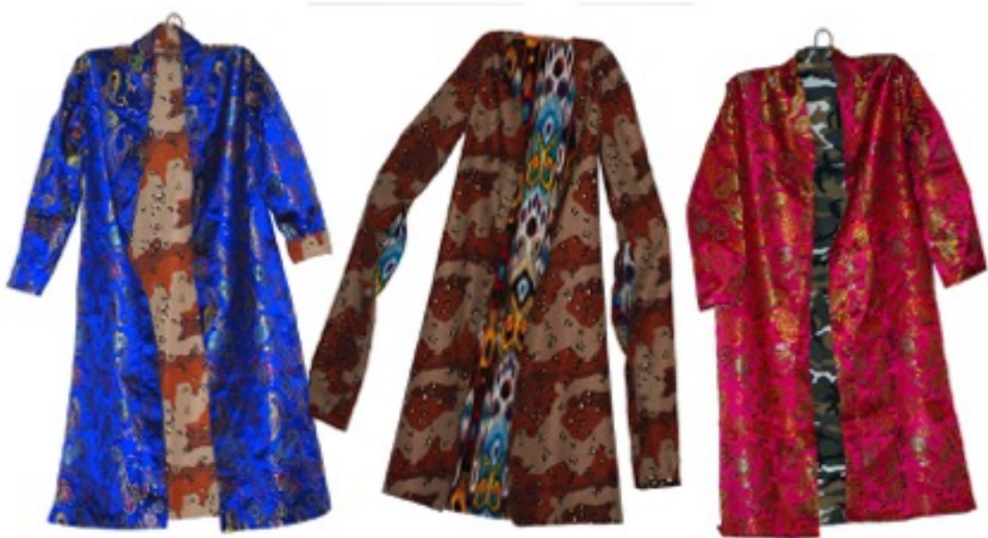
“FOR THE US MARINE CORPS IN THE CENTRAL ASIA” (suits series) .silk ,fabric.2007