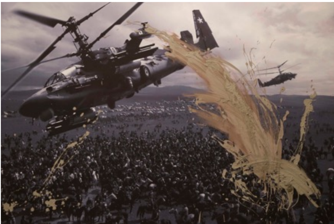
“ALPAMYSKOKPAR”-(photo- clay.. photo collage )120x180cm-2014.5+1AP