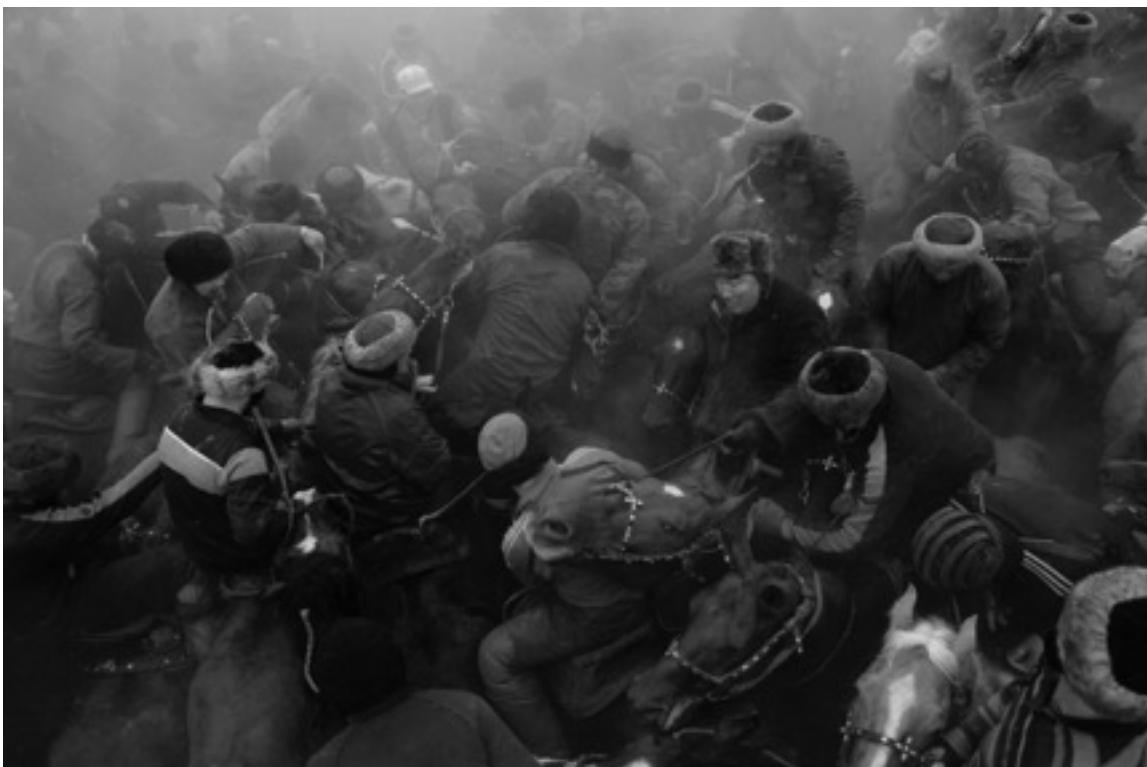
BATTLE FOR THE SQUARE-020.photo.120x180cm.2014. 5+1AP