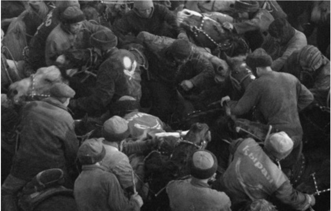
“BATTLE FOR THE SQUARE” video installation 4 channel.2009.5+1AP