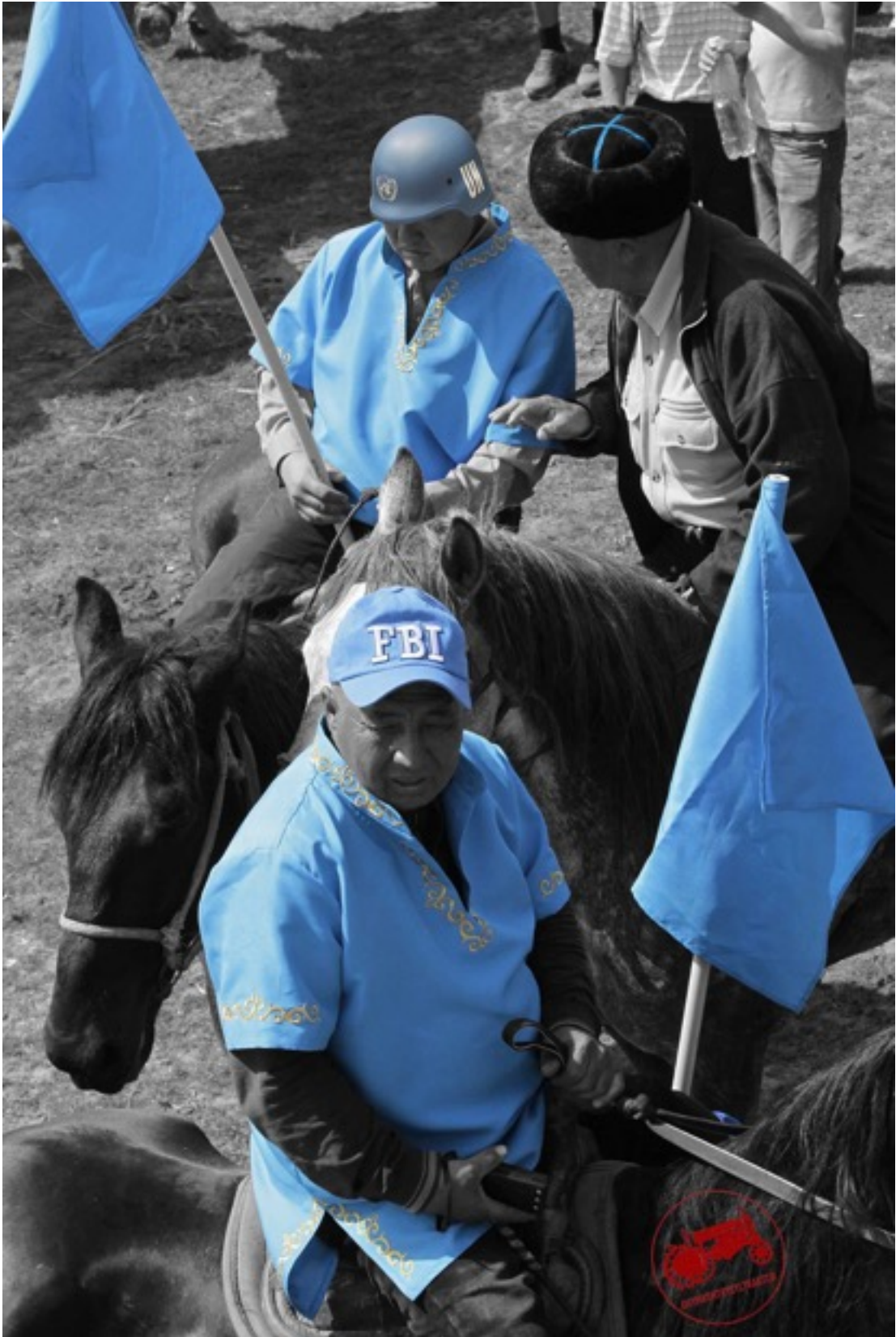
“UN & FBI” 180x120cm.photo collage.2013.5+1AP