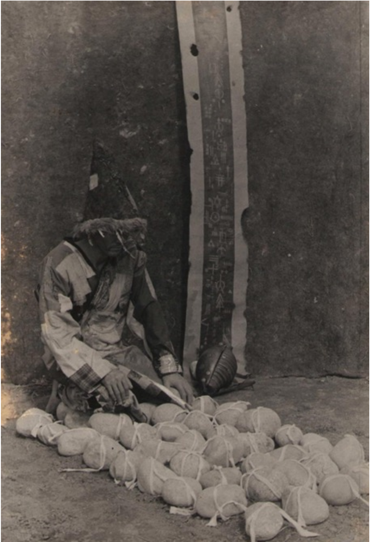
“PRAYER RUG” performance .70x50cm.photo. 1998.5+1AP