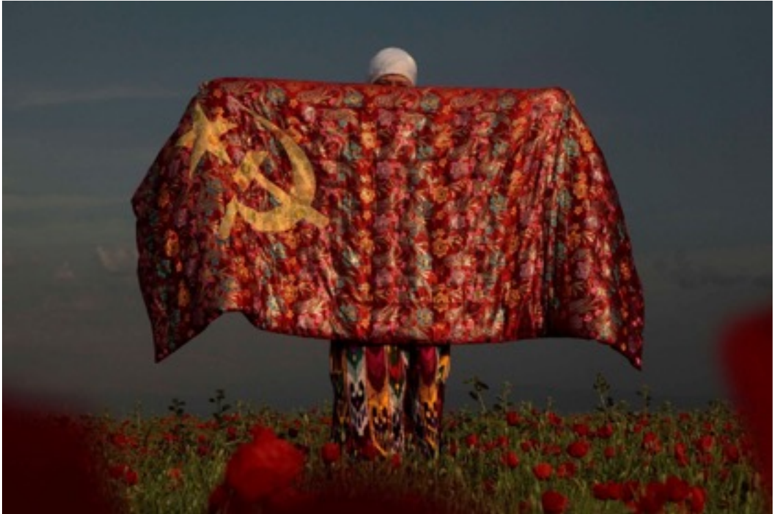
MY SOVET UNION (from the series FLAGS)-100X150cm-2013.5+1AP